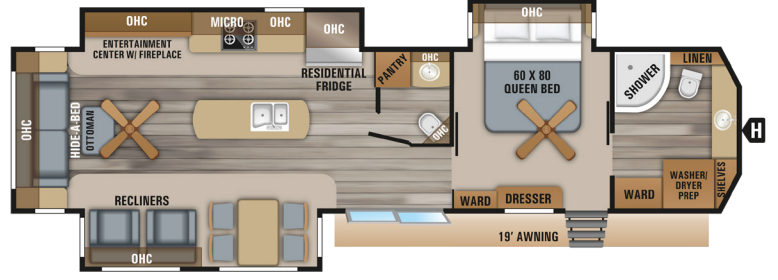
40FBTS OPTIONS: C, D