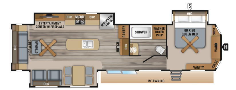
40RLTS OPTIONS: C, D