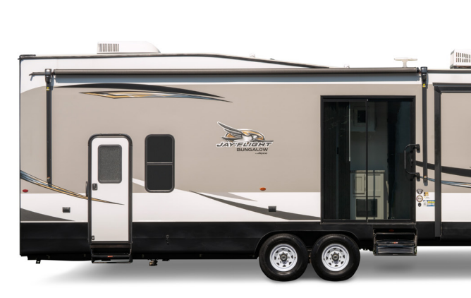
OPTIONAL FIBERGLASS EXTERIOR